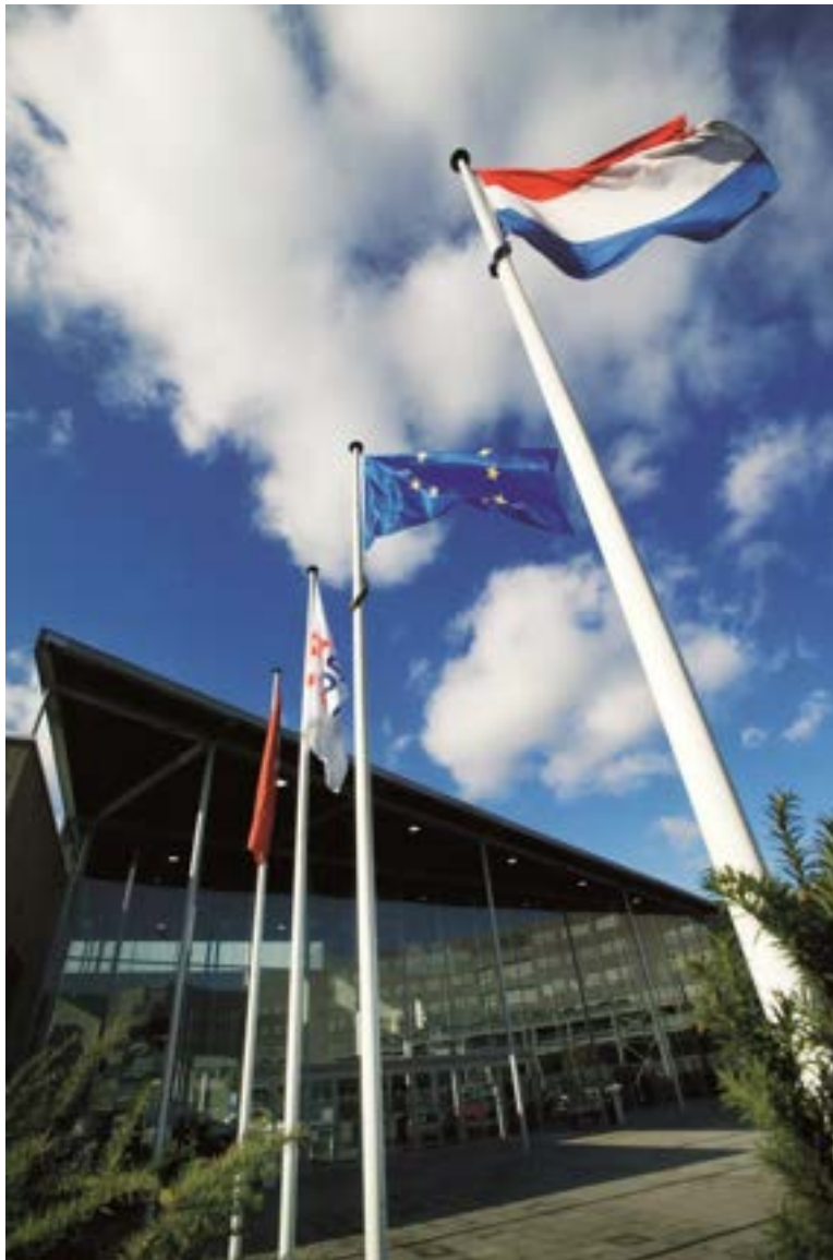
(MECC MAIN ENTRANCE)

MAIN EXAMINATION LOCATION MAASTRICHT UNIVERSITY