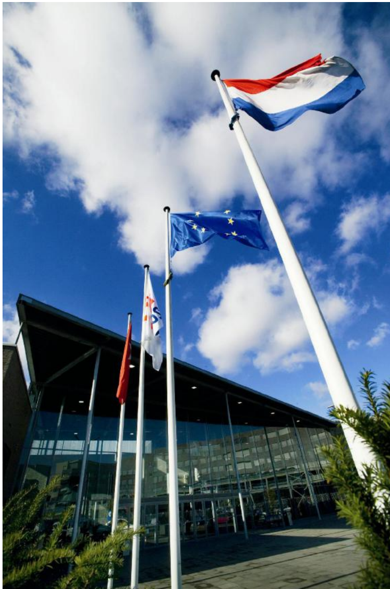
(MECC MAIN ENTRANCE)

MAIN EXAMINATION LOCATION MAASTRICHT UNIVERSITY